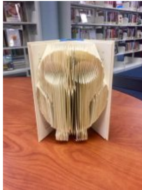
Owl Book Folding 7/8 from 6-8 p.m. Ages 18 & up. Please bring a ruler with metric measurements.