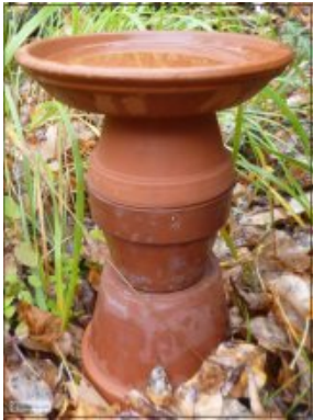
Clay Pot Bird Bath Demo 7/6/ at 6:00 p.m. All ages We will give away a bird bath as a door prize!