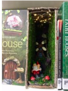
Gnome Book Nook 7/15 at 5:30 p.m. Ages 18 & up. All materials will be supplied