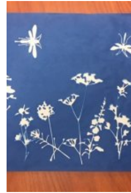
Nature Sun Prints 7/20 at 6:00 p.m. Meadowlake Park Pavilion 6 All ages. Call 580- 284-6313 to register.